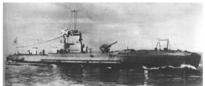
Japanese submarine I-124

The plaque was supplied by the Department of Defence, whose Defence Science & Technology Group supplied a sonar image for it of the I-124 taken only months previously. Subsequent to the unveiling ceremony, the plaque was installed on a plinth at Casuarina Cliffs, overlooking the sea.