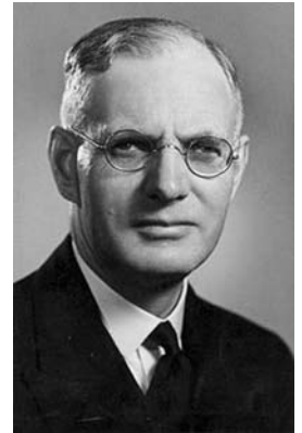
John Curtin, Australia's wartime prime minister

The RAAF Wirraways were shot out of the sky and the aircraft would be downgraded to fighter-trainer status, leaving Australia then without a single fighter. 18 Curtin warned: "Anybody in Australia who fails to perceive the