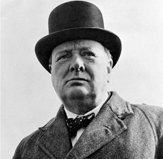
Winston Churchill, Britain's wartime prime minister

Japanese – and come to the major war against Germany and Italy.” 32