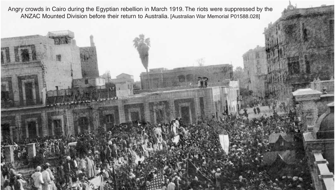
Angry crowds in Cairo during the Egyptian rebellion in March 1919. The riots were suppressed by the ANZAC Mounted Division before their return to Australia.