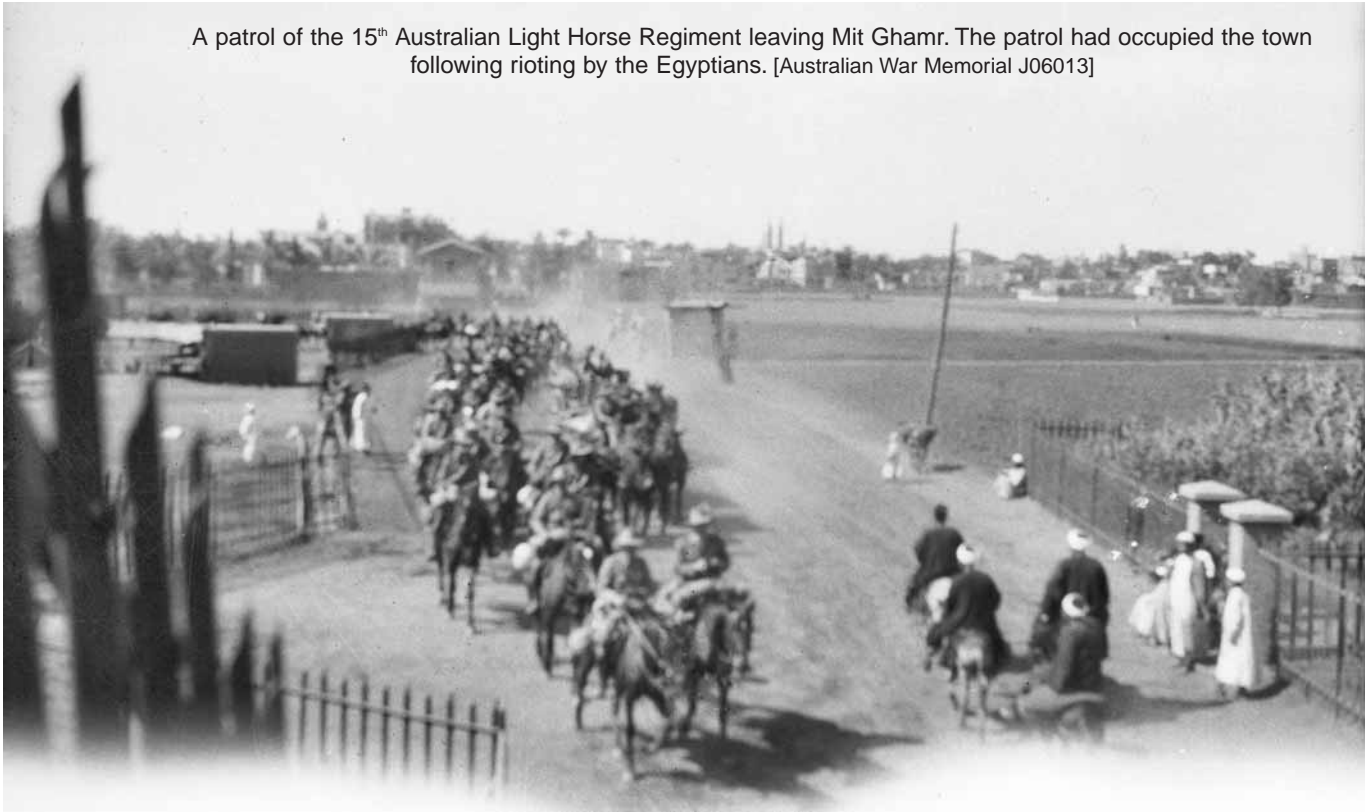
A patrol of the 15 th Australian Light Horse Regiment leaving Mit Ghamr. The patrol had occupied the town following rioting by the Egyptians.

Despite this tough response, the railway and telegraph network which criss-crossed the country continued to be targeted during the rebellion. Bridges and telephone lines were also destroyed. Numerous small clashes followed and the Australians' success must be explained by the lack of modern firearms in the civilian population.