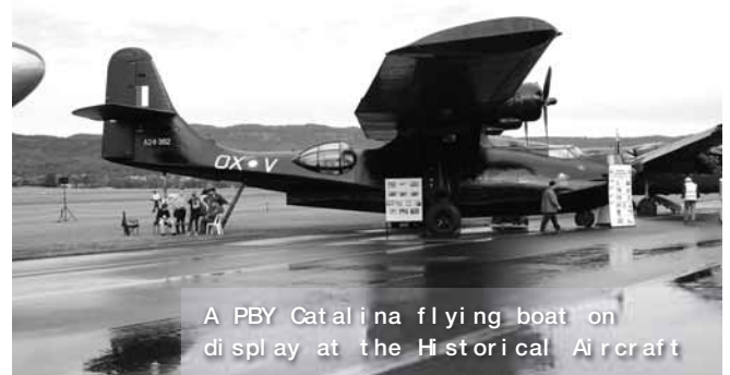
A PBV Catalina flying boat on display at the Historical Aircraft Society

HARS at Albion Park flies a Super Constellation, two Neptunes, three C47 Dakotas, two Caribou, a Catalina, a Tiger Moth and a Winjeel.