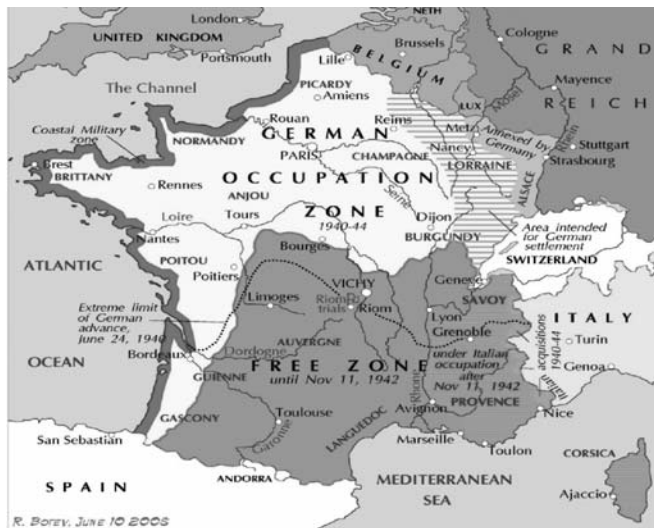
France as occupied by the Axis Powers between 1940 and 1944

This, however, was dangerous work. A person would be in very serious trouble if caught harbouring foreign Jewish refugees. Pastor Trocmé by now had become the dominant voice in village, his pacifist views predominating, and so the work continued. Fortunately, the Gendarmes tended to take a reasonably lenient approach to law enforcement in the Free Zone at this stage of the war.