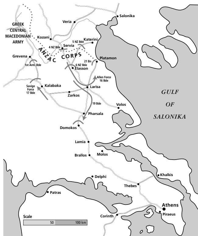
Anzac Corps delaying position in central Greece – Mt Olympus is just to the south-west of Platamon and Pinios Gorge is on the southern flank of Mt Olympus.

The mismanagement of the only available British armour had grave consequences just days later, when the fate of Anzac Corps hung in the balance. Faced with multiple German threats across his front, Blamey needed to get his men south, below Mount Olympus, the ancient home of the Gods which dominates central Greece. The Australian general paid greatest attention to his centre and left, and somewhat neglected his right, which rested on the Aegean Sea at a place called Platamos (Map 2, where it is shown as Platamon). There, he posted just one New Zealand unit, 21 st Battalion, thinking this would be sufficient to guard the only route to the south, through a railway tunnel right on the coast. Since the tunnel could be easily dynamited to prevent a German flank manoeuvre down the coast, it was assumed that 21 st Battalion could hold the line here on its own.